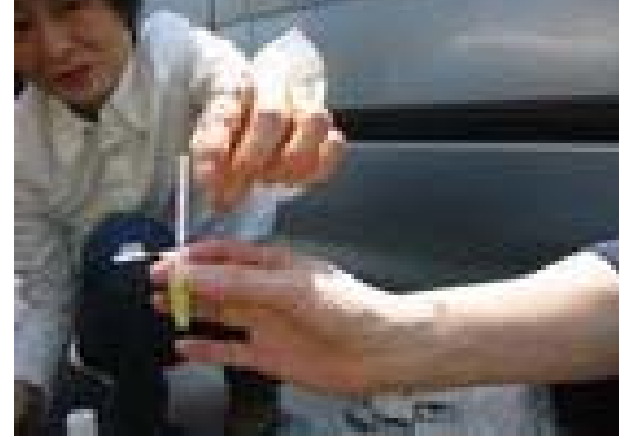
Put test paper into the test tube.