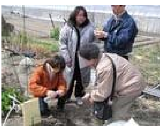
Put a sample into a test tube.