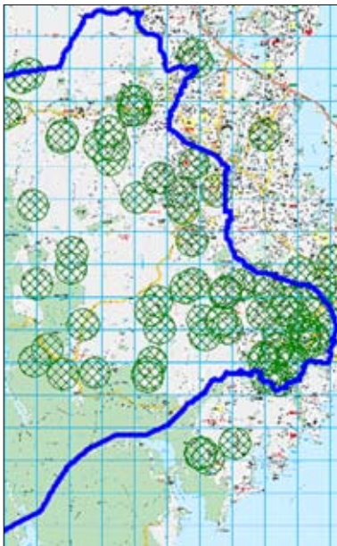
Waitakere District: map of 170 registered GMO-free properties (137 ha) with their 8 km radius

In October 2003, the NOOM bill finally passed in Parliament by 92 to 24 votes. The bill prescribes a detailed case-by-case risk assessment, strengthens the leadership of the Ministry of Environment, and allows for broad public participation procedures. The biotechnology industry warned the Government that only very few applications would pass the assessment procedure. Until today, the ERMA web page lists approvals for 39 different GE plants for field testing. Of those 39, only one application for Roundup resistant onions (Jun 2003, approved December 2003) and four applications for Bt cabbage, broccoli, cauliflower and forage kale (October 2006, no decision yet) were launched after the debate on GMO moratoria in took off in 2000. Contrary to claims by the Life Sciences Network, GE crop trials are apparently not that essential for the well-being of New Zealand's economy, nor has New Zealand experienced a loss of 100,000 jobs.