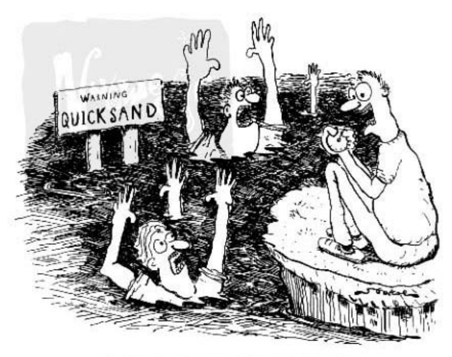
"Come on, faster, this is pathetic lads"

The more you move the more you sink? A matter of (no) discussion